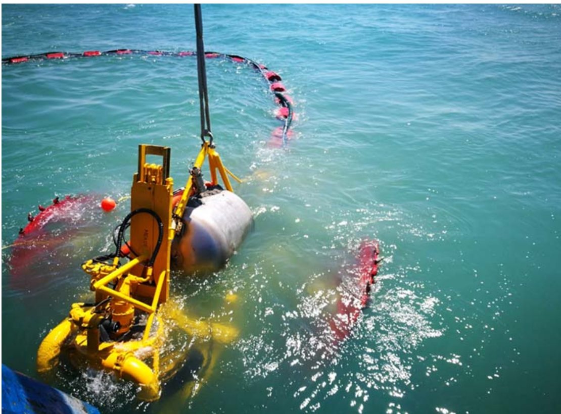
PTM in the water during trenching operations