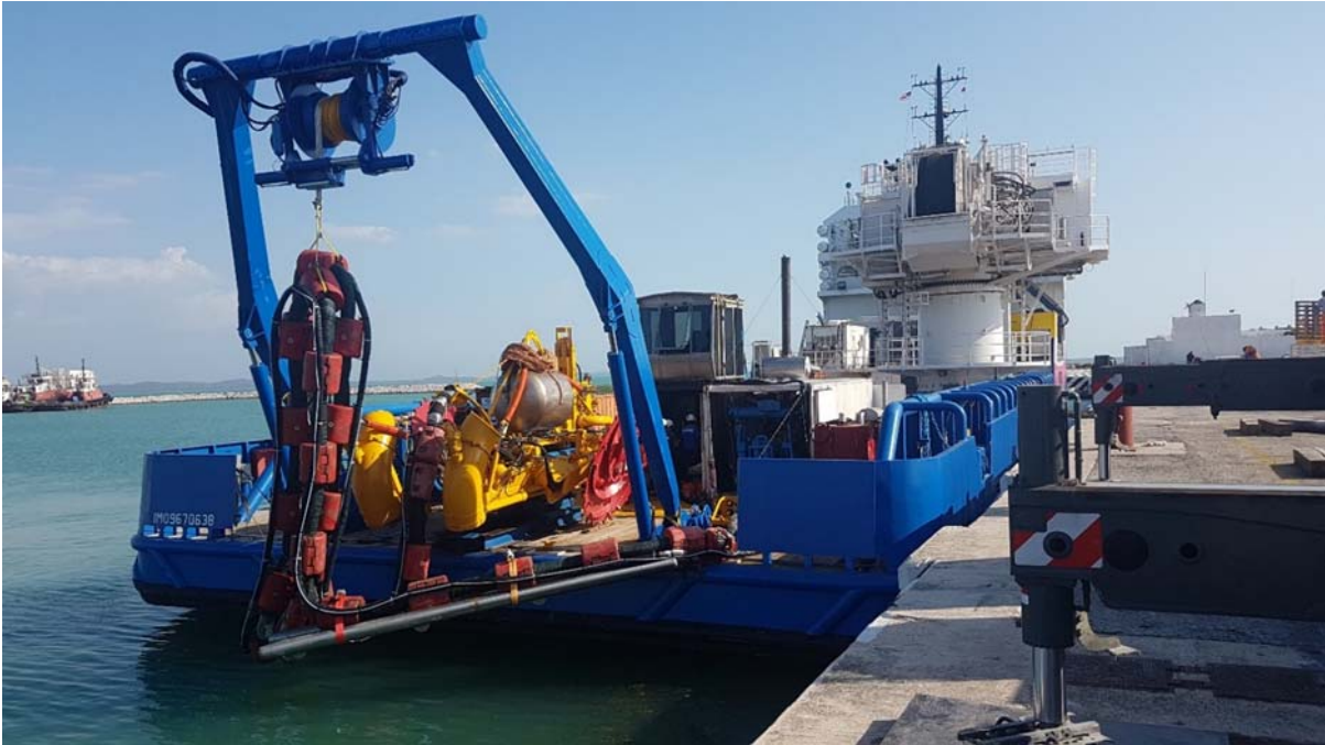
TSV equipped with trenching spread