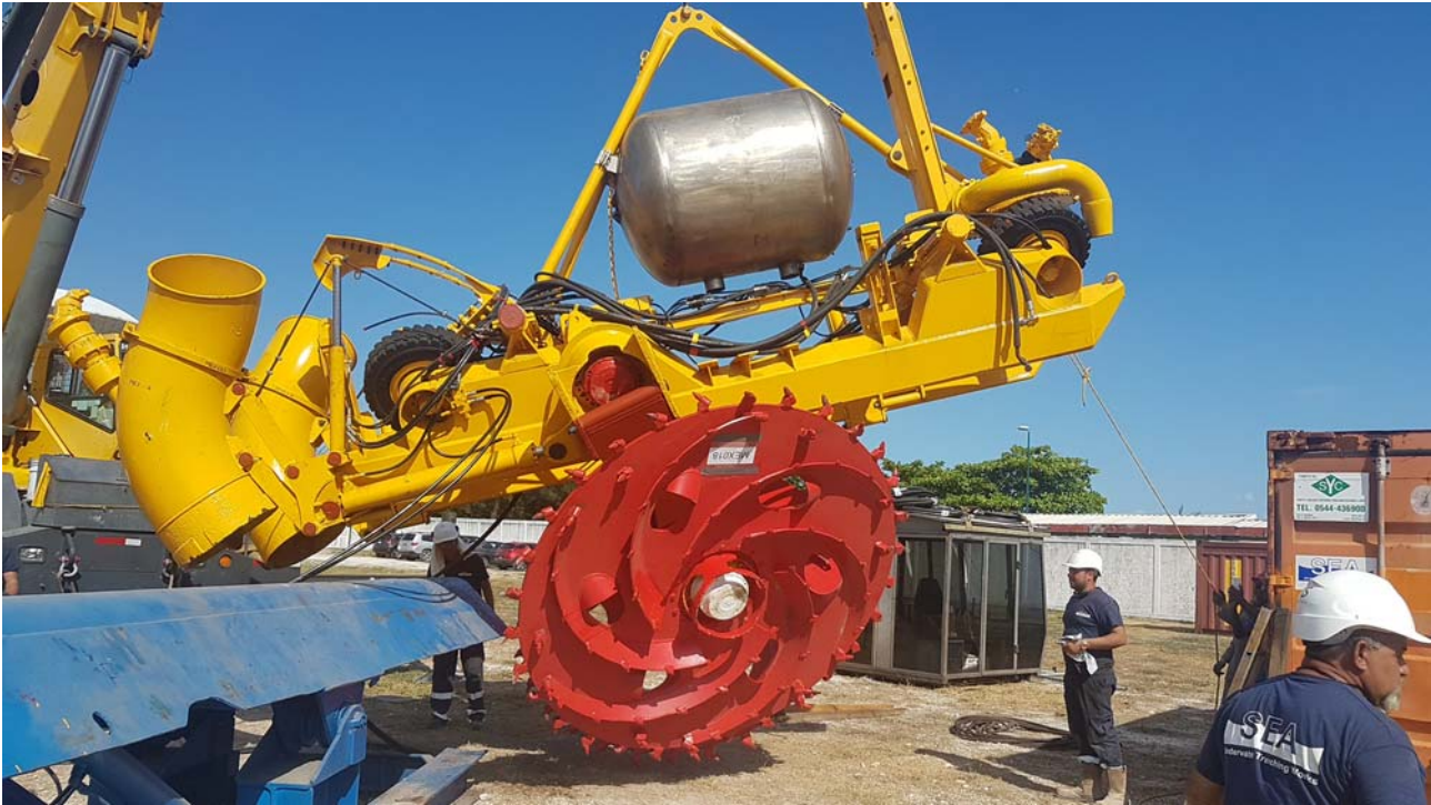
PTM during assembly phase onshore